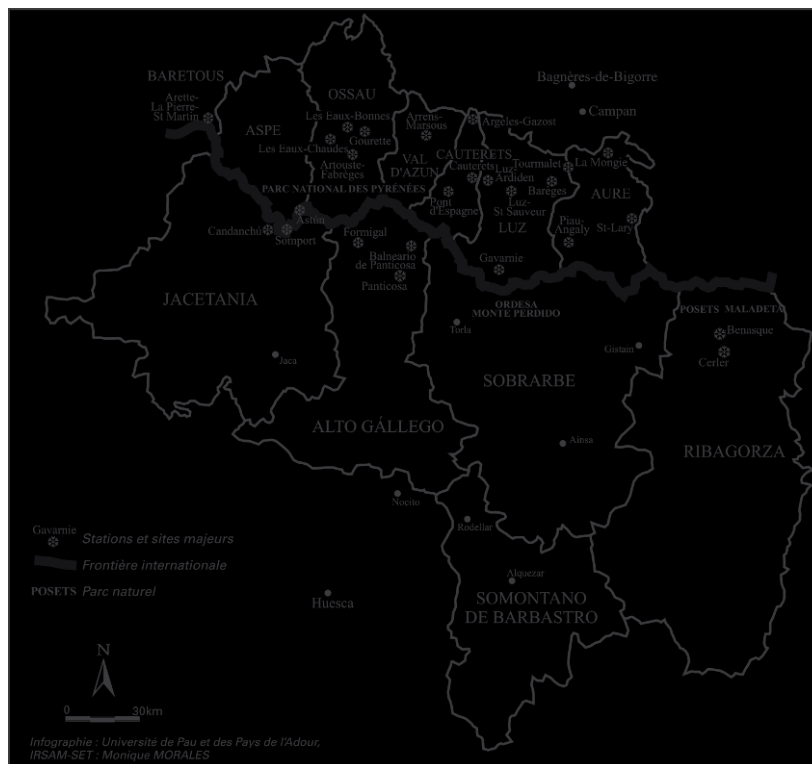
Figure 1: the mountain territories investigated