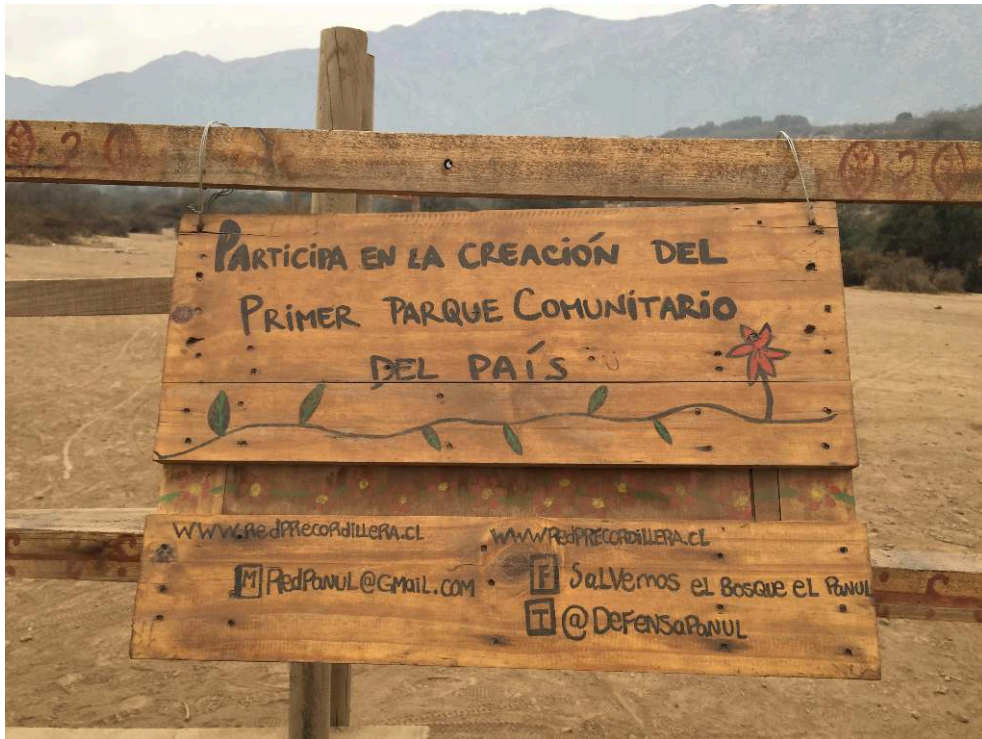
Fig. 5. Panel installed at the entrance of El Panul (Translation: "Participate in the creation of the first community park in the country")