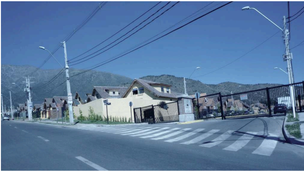
Fig. 2. Photograph of condominios -type housing on the La Florida foothills, south of Lo Cañas, 2008