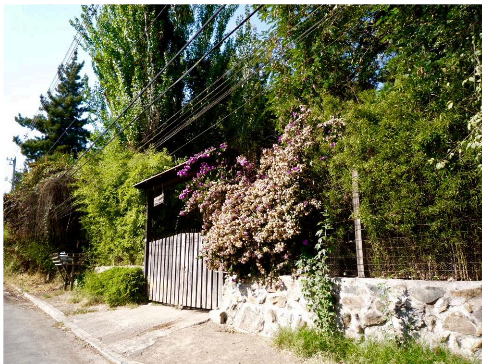
Fig. 1. Entrance to a house in Lo Cañas, 2008