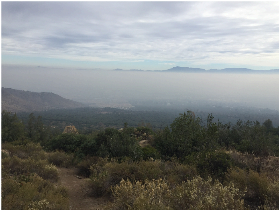
Fig. 4. View of El Panul forest. In the background, a cloud of pollution covers the city of Santiago