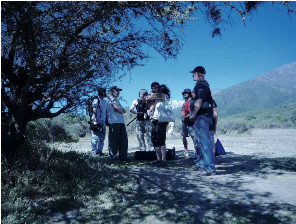
Fig. 3. MEMBERS OF THE GDP AT THE ENTRANCE OF THE PANUL FOREST