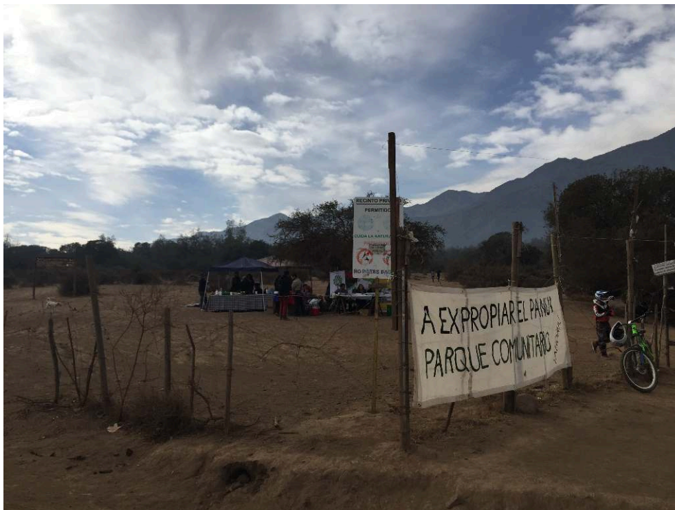
Fig. 6. Entrance to El Panul. You can read on a banner, "Let's expropriate El Panul", while the panel on its left says "Private property". In the background, a stand where the GDP welcomed hikers on Heritage Day.